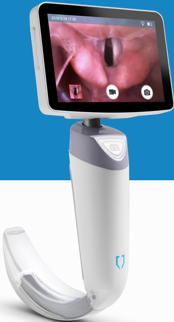
Video Laryngoscope VS-10 H